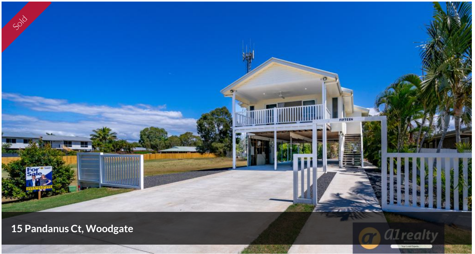
15 Pandanus Ct, Woodgate