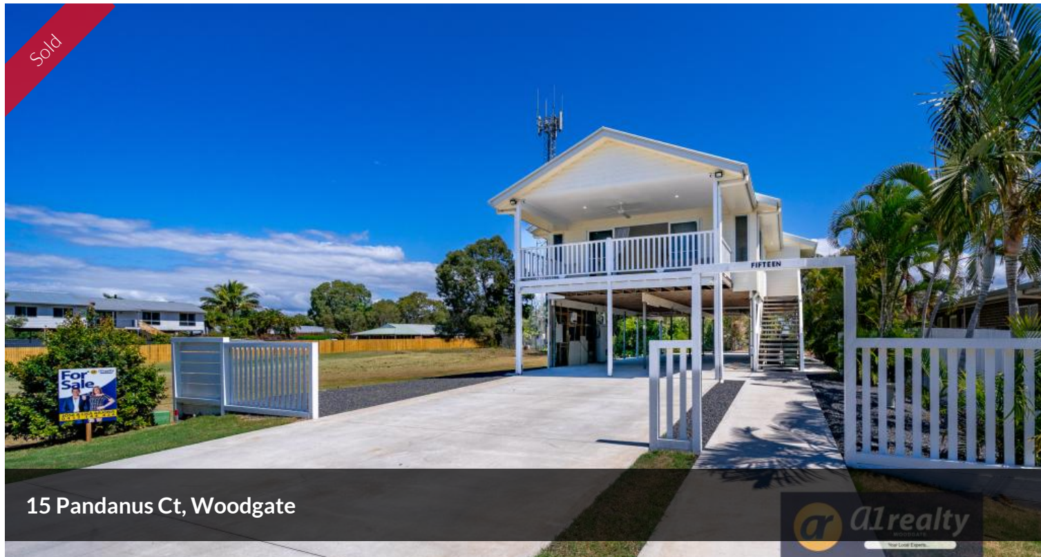
15 Pandanus Ct, Woodgate