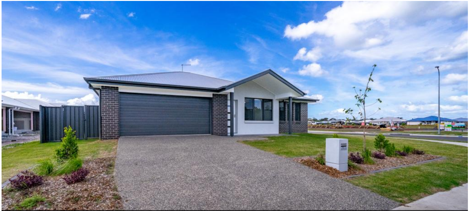
Unit 1, 1 Gull Street, Woodgate