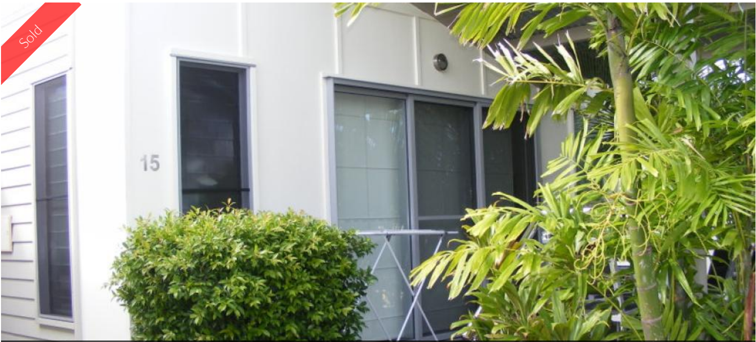
Villa 15, 151 Esplanade Street, Woodgate