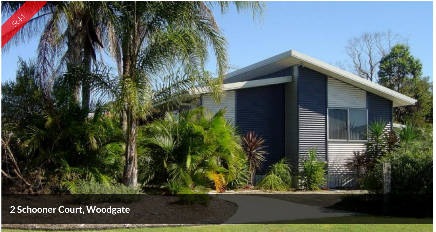
2 Schooner Court, Woodgate