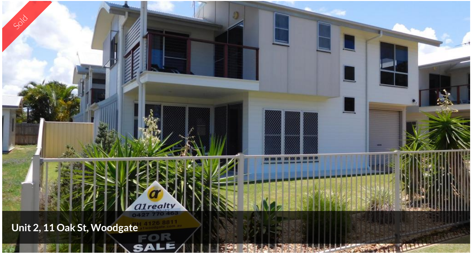
Unit 2, 11 Oak St, Woodgate