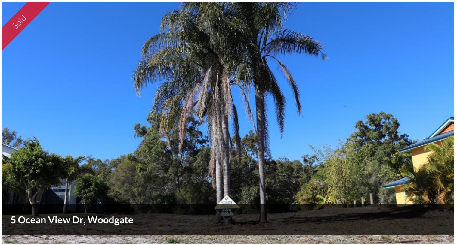
5 Ocean View Dr, Woodgate