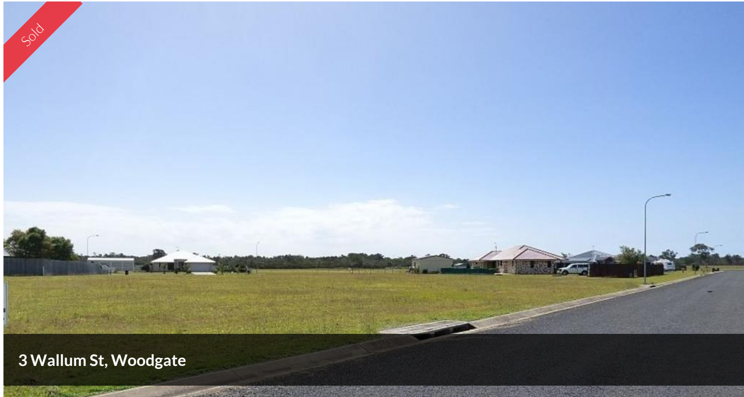
3 Wallum St, Woodgate