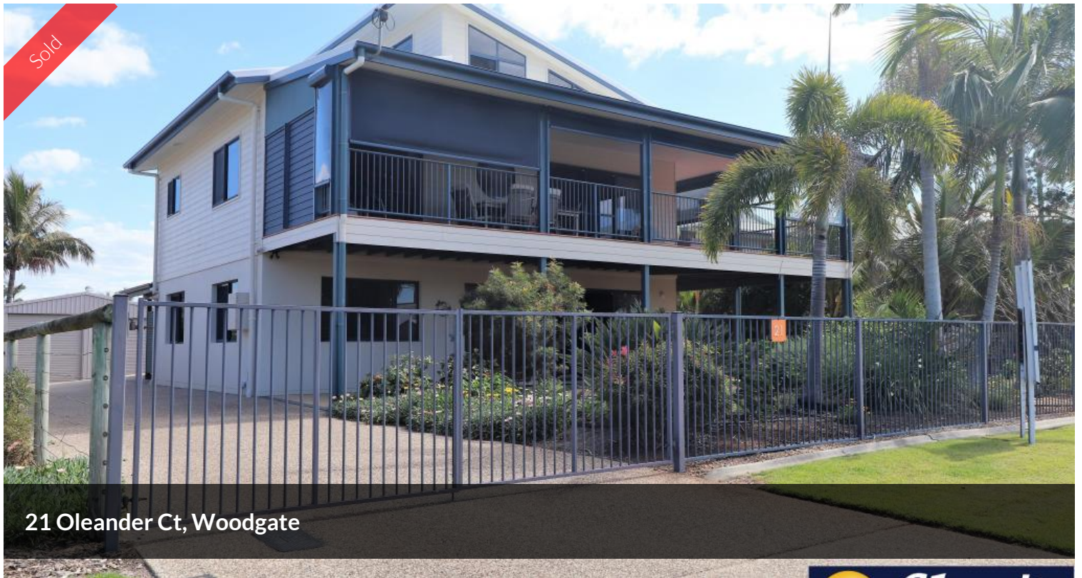
21 Oleander Ct, Woodgate