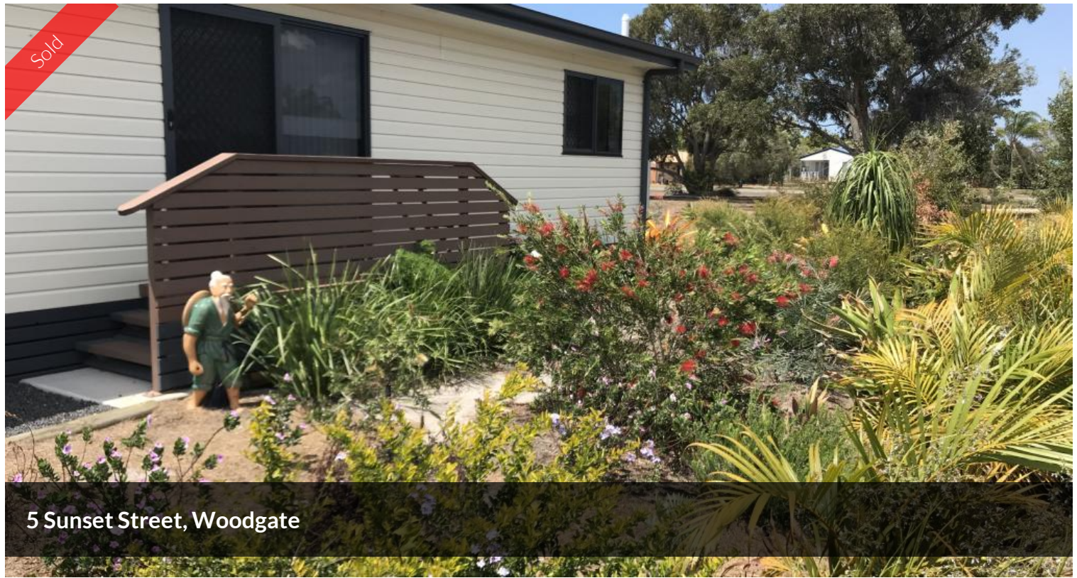
5 Sunset Street, Woodgate