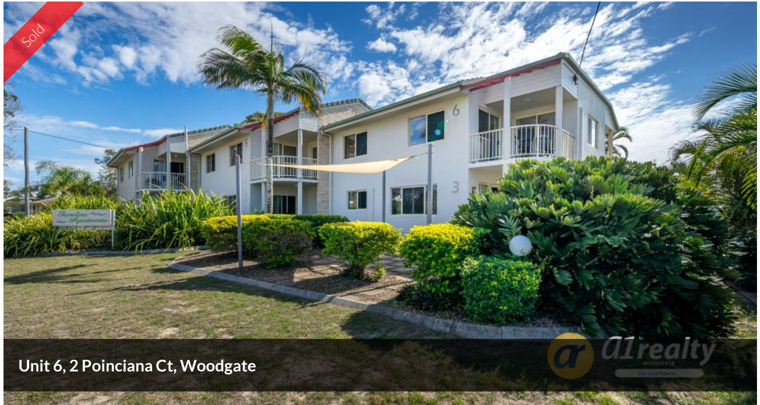
Unit 6, 2 Poinciana Ct, Woodgate