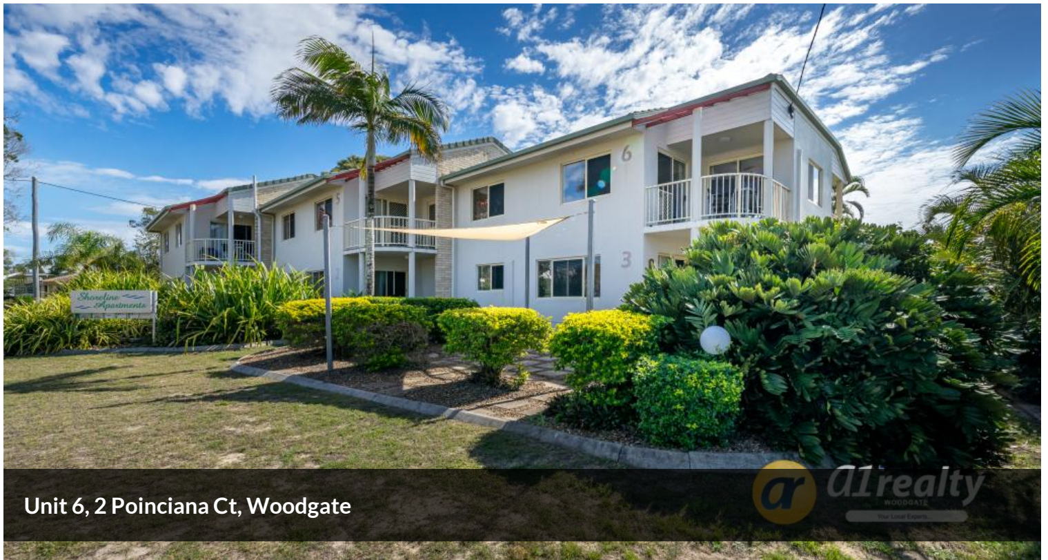
Unit 6, 2 Poinciana Ct, Woodgate